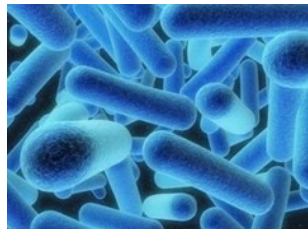
Caused by the bacteria Legionella pneumophilla